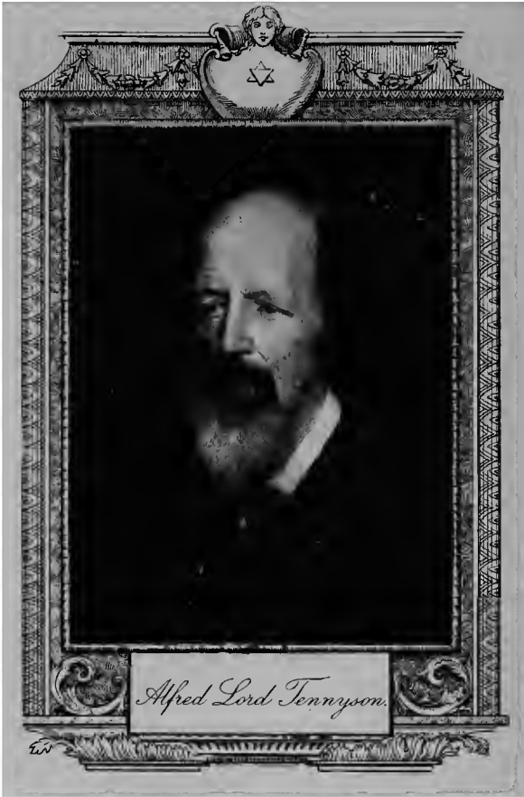
Alfred Lord Tennyson.